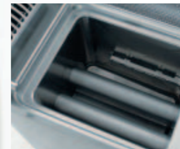
Deep drawn fryer well with rounded corners and deep cool zone

Each unit does not need to sit on its own base, the ambient base units start at 400mm wide and extend to 1600mm. Whereas the refrigerated bases are in 1200mm or 1600mm widths. The gas and electric oven base units are 800mm wide. The designer can mix and match bases with top units and free standing units to maximise work flow and efficiency, creating the perfect work station for the service being provided.