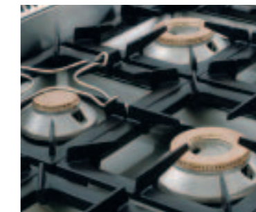
2 part burners for easy removal for cleaning and deep indent to trap spillage