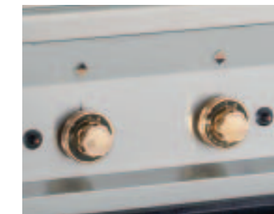
Ergonomically designed control knobs for ease of operation